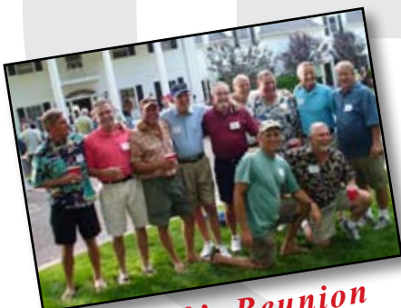
Big 60's Reunion