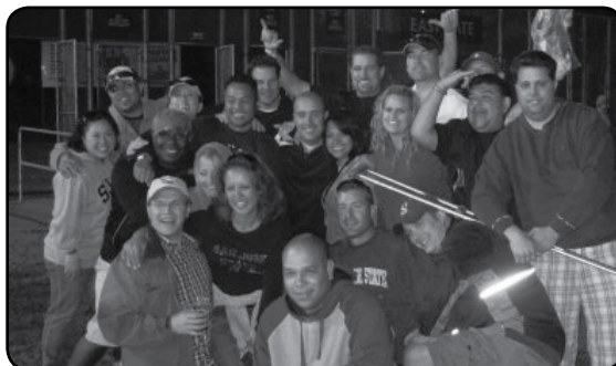
Our motley crew rallied outside the stadium after the Spartans narrow defeat to Idaho.