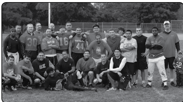
The active and alumni teams pose together after the competitive game.

After the game, both teams rehydrated over a keg and then headed to BJ's Brewhouse for a couple more rounds and a much-needed meal.