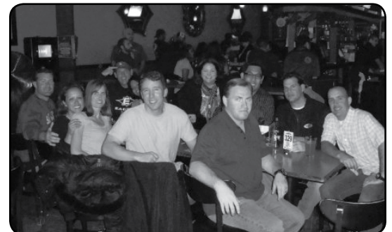
The crowd migrated to San Jose Bar & Grill after the game to thank them for sponsoring the tailgate.