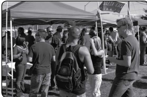
Our 600 square foot spot was packed full of party-goers for most of the day.

The actives and alumni from throughout Gamma Xi's history for all-you-can-eat catered tacos and plenty of libations. The t-shirts were popular and on display throughout the afternoon and into the evening as we supported the Spartans inside the stadium and then met up at San Jose Bar & Grill after the game.